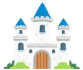
Next month our study is Castles