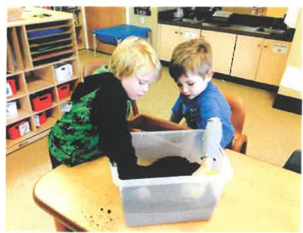
Planting radishes, green beans and basil.