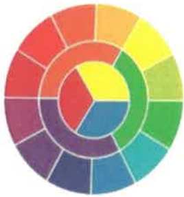
The Color Wheel